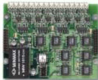
EXP-8V extra 8 voltage output channels