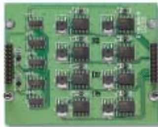
EXP-8A 8 precision voltage-to-current converters/transmitters