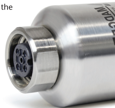
Closeup of the M12 Connector