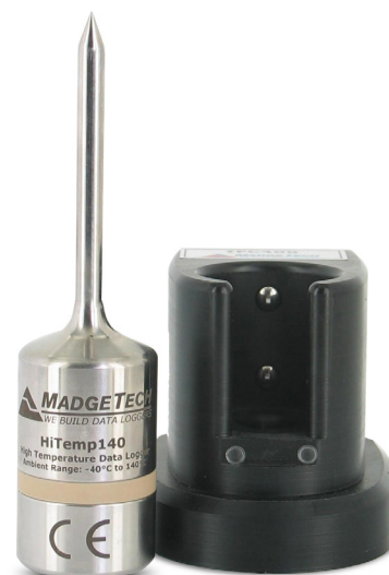
IFC400 (sold separately)

The HiTemp140 can store up to 32,700 readings, and features a rigid external probe capable of measuring extended temperatures, up to 260^{\circ}\text{C} ( 500^{\circ}\text{F} ). Custom probe lengths are available up to 7 inches. The device records date and time stamped readings, and has non-volatile solid state memory which retains data even if the battery becomes discharged.